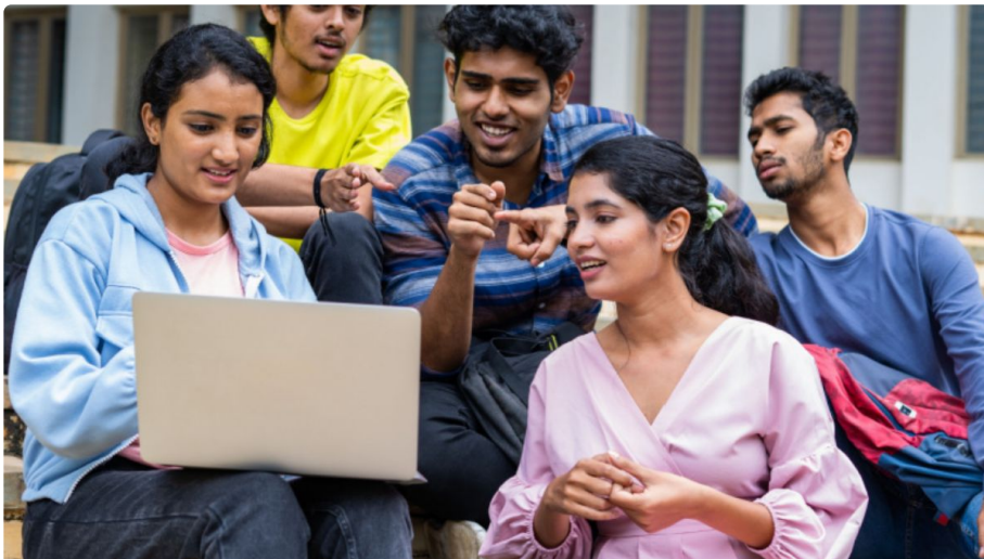
National Credit Framework

National Credit Framework: The University Grants Commission on Monday, April 10, 2023, released a public notice regarding National Credit Framework (NCrF). The official notice said that the National Education Policy 2020 lays emphasis on the integration of vocational and general education to enable increased flexibility and mobility in education. A high-level committee (HLC) constituted by the government of India has formulated NCrF.